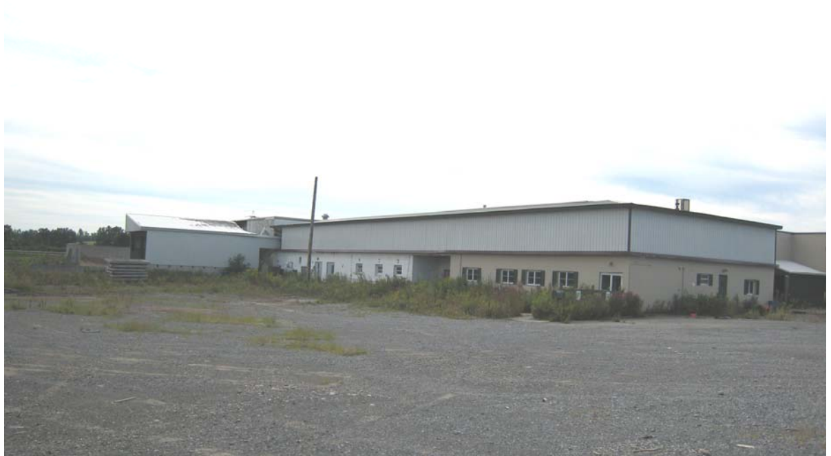
WAREHOUSE/MANUFACTURING FACILITY FOR SALE